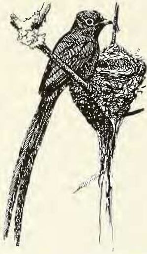
Seychelles Black Paradise Flycatcher Terpsiphone corvina

Seychelles Black Paradise Flycatcher Terpsiphone corvina Resident La Digue. Endemic.